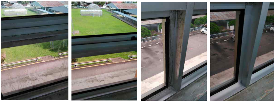
Window frame full of body grease (before and after)