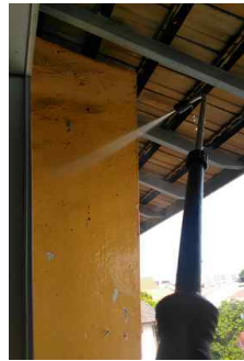
Pressure washing (cleaning inside and outside of the windows, no need scaffold and boom lift)